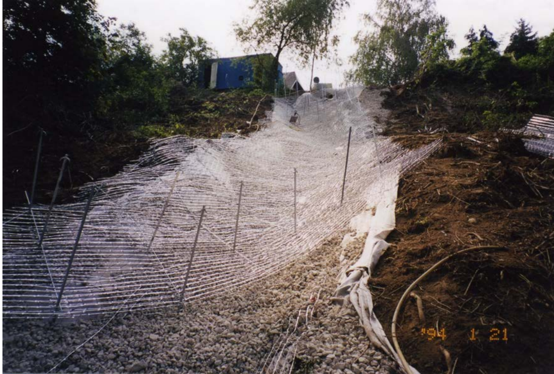
Fig. 5: Funnel seen looking uphill – J.K.S. panels placed diagonally to the fall line of the slope.

Creating a funnel, opening width approx. 6 m