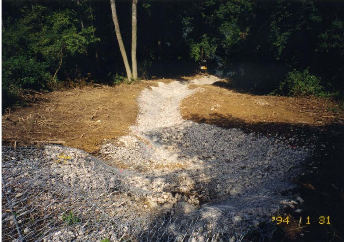
Fig. 6: Drainage funnel seen looking downhill from the forest trail to the river

On both sides of the completed channel the three dimensional screen that covers stable terrain was topped with humus and a cover net was laid down over the entire surface.