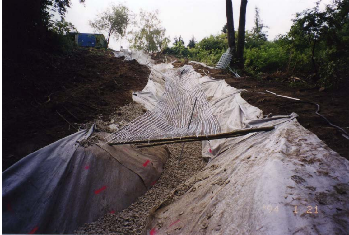
Fig. 4: Uphill view – partial gravel filling and vertical fall line placement of J.K.S. screen.

Installing the second (middle) layer of three-dimensional steel screen panels on top of the first layer of stone filling (approx. 50 – 60 cm deep), three-dimensional steel screen panels are laid down following the vertical fall line of the slope, width approx. 1.20 – 2.40 m