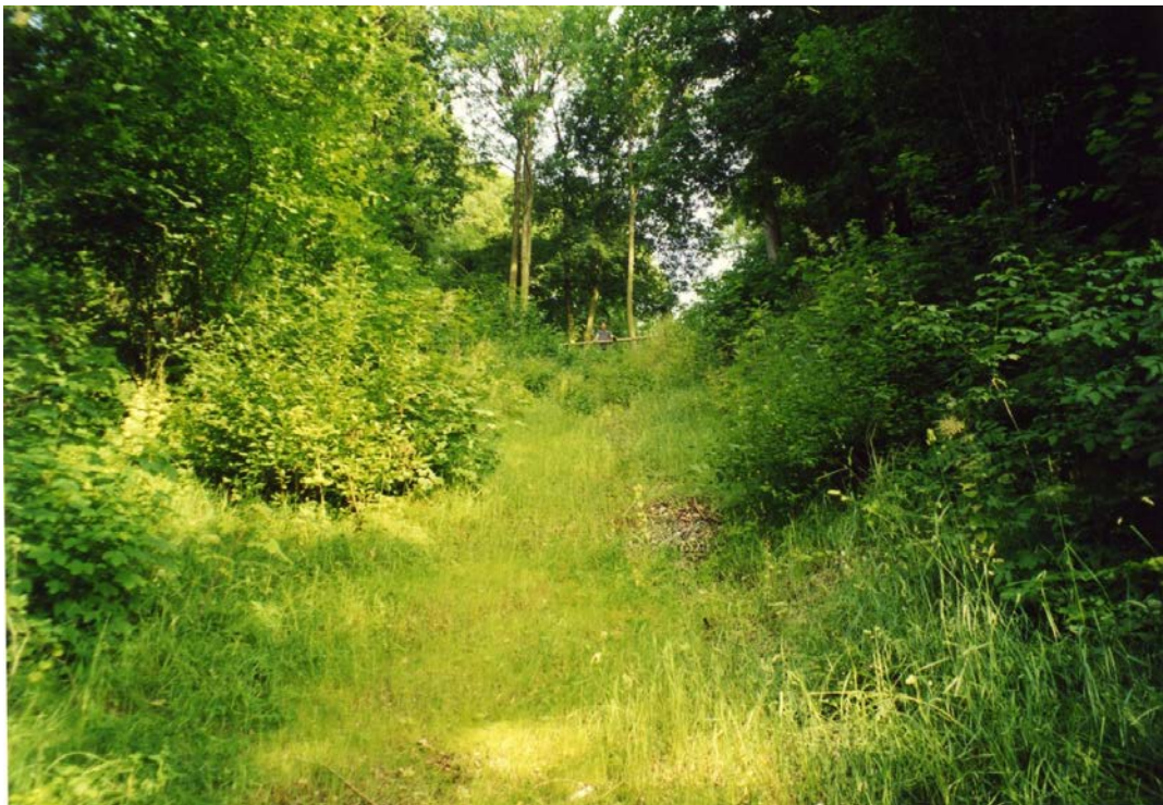
Fig. 1: Stabilised terrain - lower section (Upward view from river)