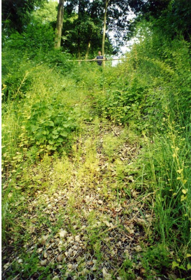
Fig. 8: Bank stabilisation with the Krismer® System (2000)

One year after construction work was completed, the surface of the Krismer® System stabilised drainage channel was given an additional fertilizing.