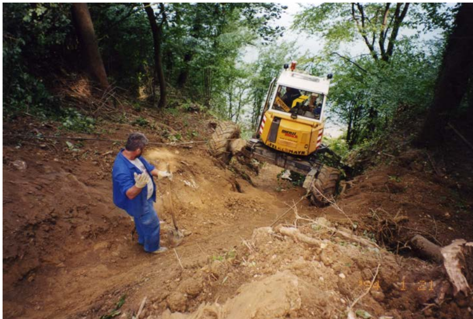
Fig. 2: Excavation work to clean the eroded trench and construction of the new drainage channel.

To meet these requirements, the "System Krismer® for Drainage and Channel Protection" was chosen as the most favourable alternative to meet the requirements of this installation.