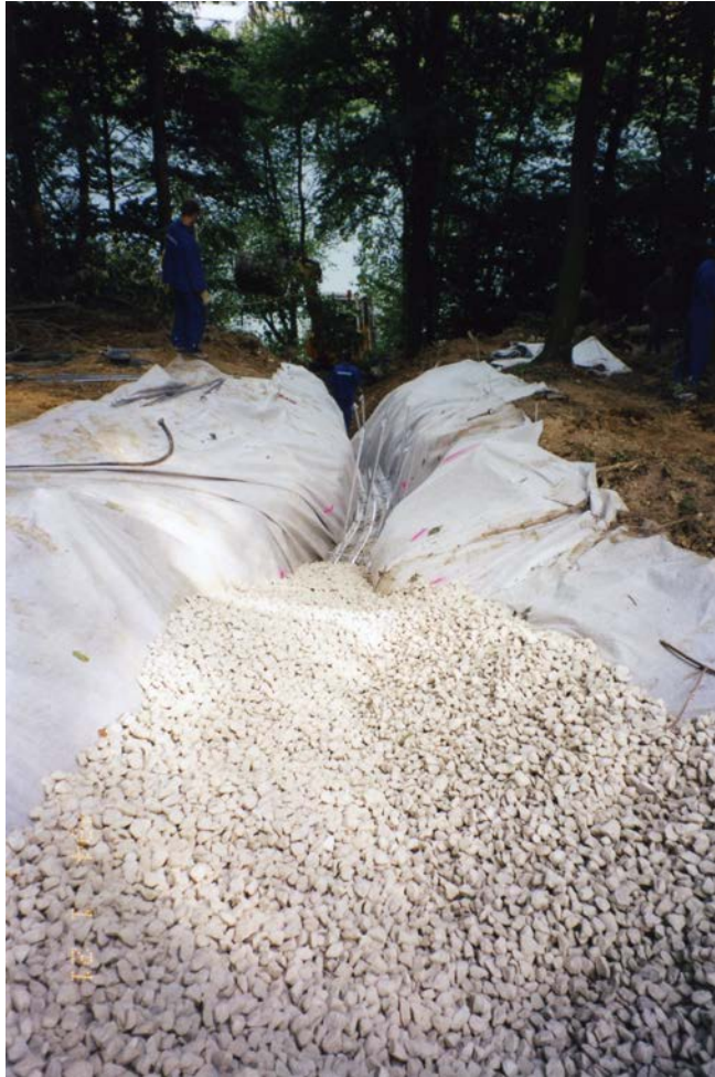
Fig. 3: Drainage Channel – View from Above